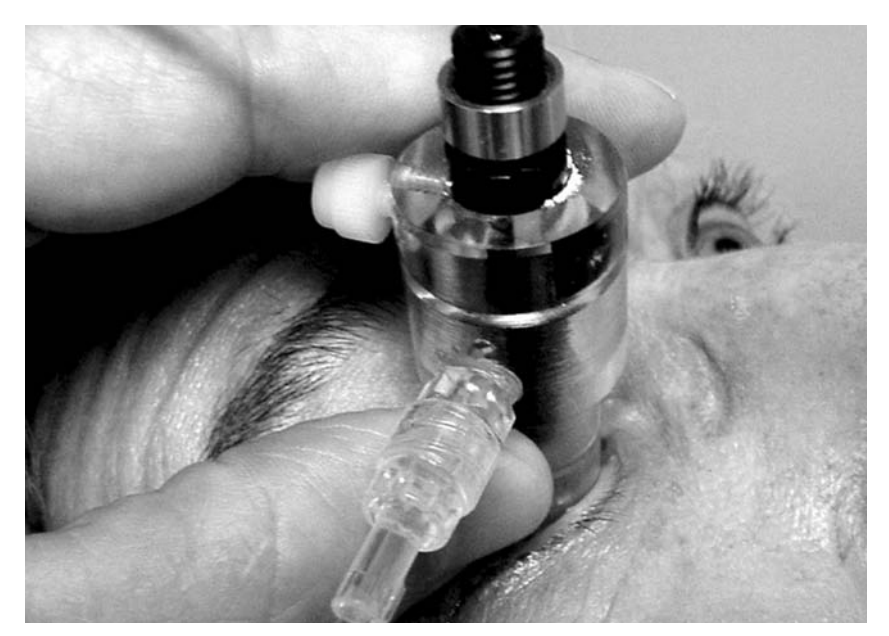
With the Luer filler port facing temporally, the left hand/palm rests on the forehead (given the biometry instrument is to your left), and is used to reduce Shell pressure on the eye. Try to keep the A-scan instrument in your direct line of sight.

Even the skilled technician may have parallax difficulties in centering the